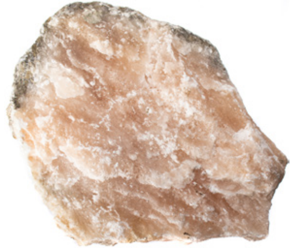
Pictured above: alabaster gypsum specimen

a. What materials was gypsum used to create?