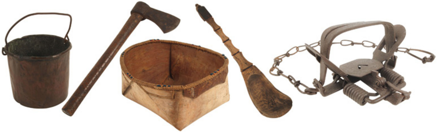
Kettle Identifier: 176519

c. Which of the fur trade items, pictured below, do you think would be most useful for people trying to survive in Michigan's wilderness in the 1800s? You can click each item's link to learn more. Draw a picture to describe how the item might have been used.