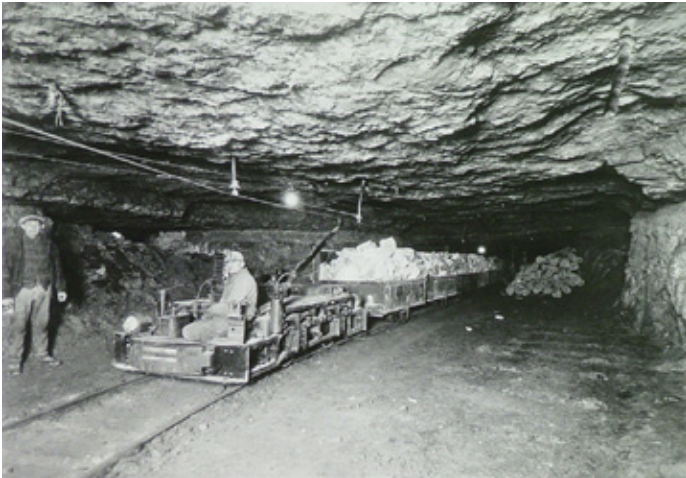
Pictured above: Interior of gypsum mine in Grand Rapids, circa 1920-1940.